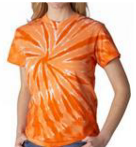
Tie Dye - Orange